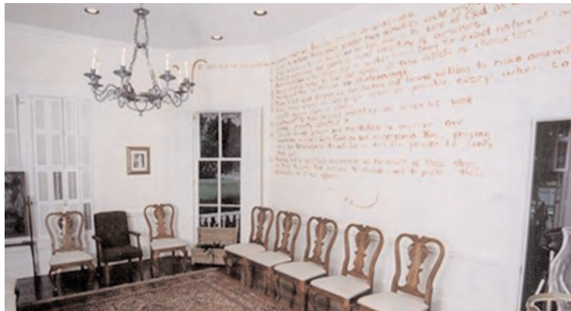
The 12 Steps and the Serenity Prayer are hand-painted on the wall of GraceWay's Group Counseling Room pictured above.

God, grant me the serenity to accept the things I cannot change, the courage to change the things I can and the wisdom to know the difference.