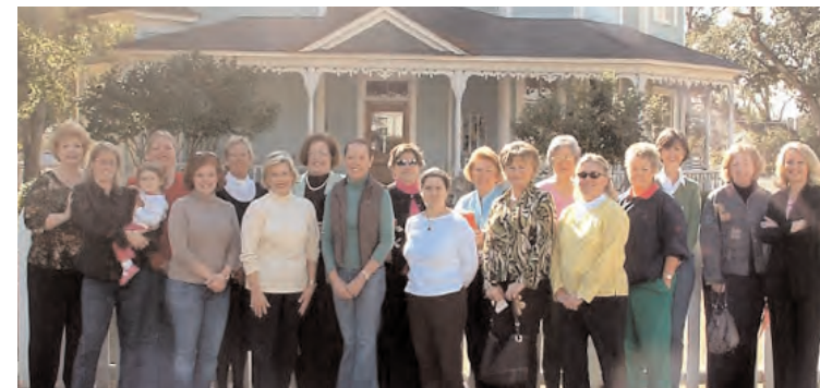
Hats off to our Amazing “A TEAM” volunteers extraordinaire! Fantastic job, ladies!

GraceWay is a 501 (C) (3) non-profit, faith-based, long-term substance abuse treatment community for women. GraceWay provides a spiritual home environment that empowers residents to become productive members of their families and society through intensive application of the Twelve-Step methodology.